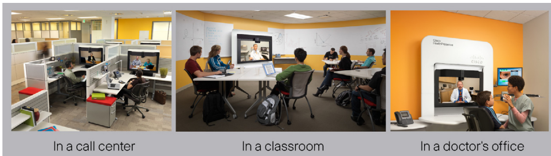
In a call center